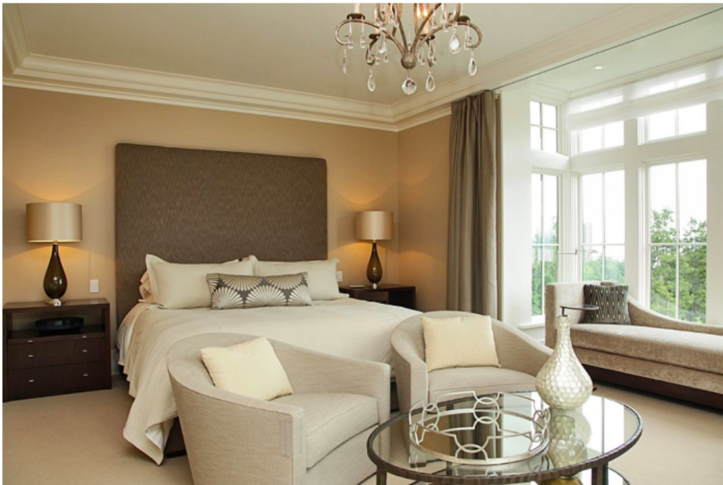
Warm neutral hues and oversized seating bring a sense of comfort to a bedroom designed by LeeAnn Baker.

“The right placement of furniture will take any large room and make it feel just right for the people living in it. I like placing seating areas—which to me means two extremely comfortable upholstered chairs—at the foot of the bed with a beautifully upholstered ottoman in between. The arrangement fills the room, creates a lovely composition for our eye to take in, and adds the perfect cozy spot to curl up and finally finish reading that book.”